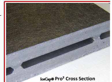
IceCap® Pro 2 Cross Section

IceCap® Pro 2 is also available in solid 2" thick X 48" X 96 sheets. FASCOAT is the only top surface option available for this product. The solid sheets are used in applications where the outside perimeter of the ice surface needs to be raised to the level of the ice dam and the ice cover, and will not be removed.